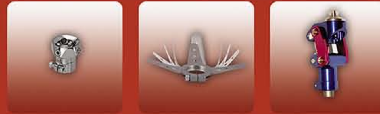
22MM / 25MM SERIES

TI Med, Inc. 381 Van Ness Avenue, Suite 1514, Torrance, CA 90501 USA TEL 800-805-3346 TEL 310-212-1232 FAX 310-212-1236 www.ti-med.com